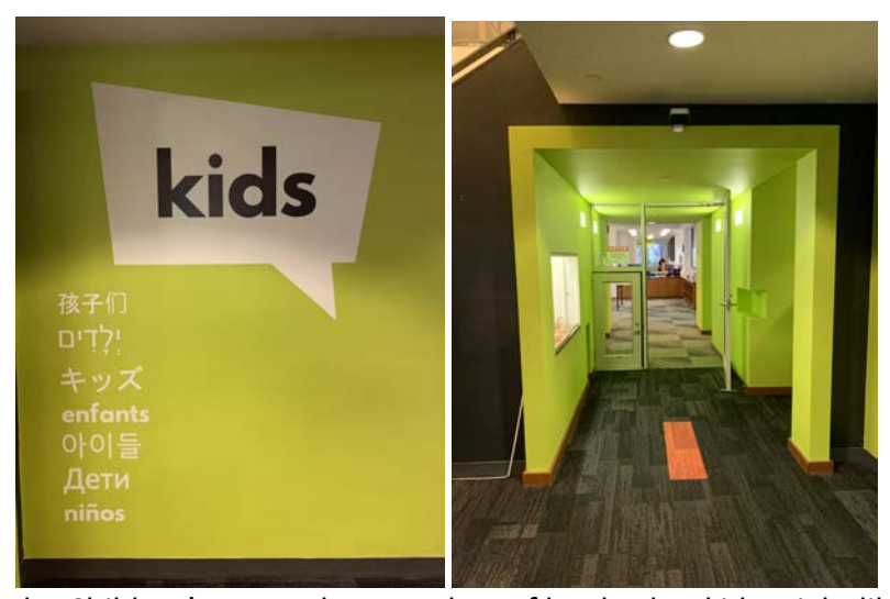
In the Children's room, there are lots of books that kids might like.

I can look at the books, and if I want to, I can take some home.