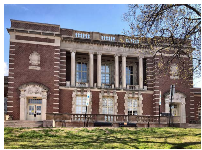
The library is a great place to visit!