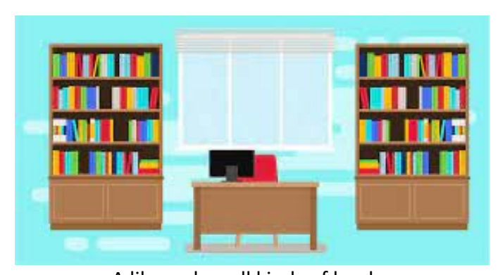
A library has all kinds of books.