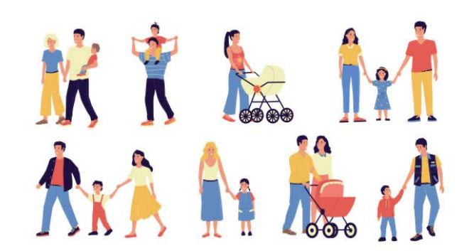
I can go there with a grownup.