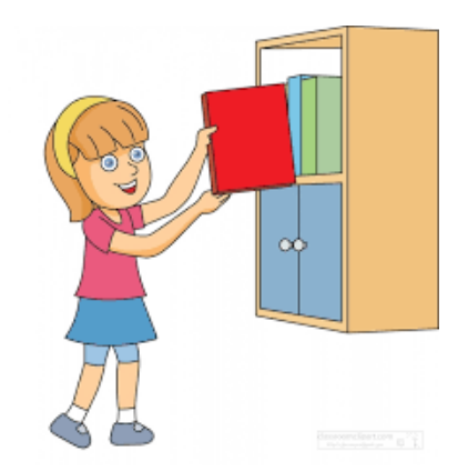
I can take books off the shelves to look at.