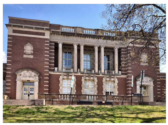
The Brookline Village Library is at 361 Washington Street.