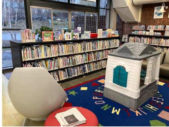
In the Children's room, there are lots of books that kids might like.