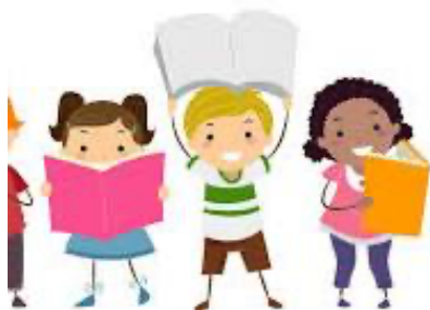
I can look at the books, and if I want to, I can take some home.