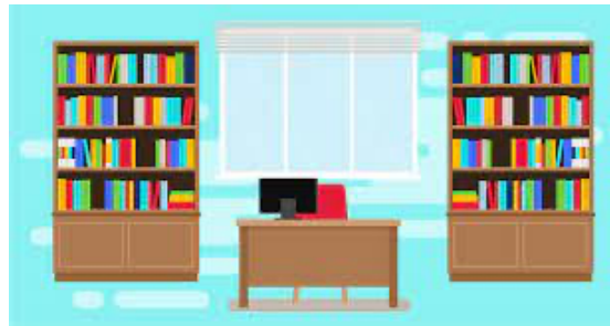
A library has all kinds of books.