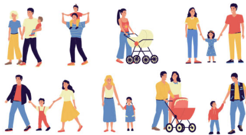
I can go there with a grownup.