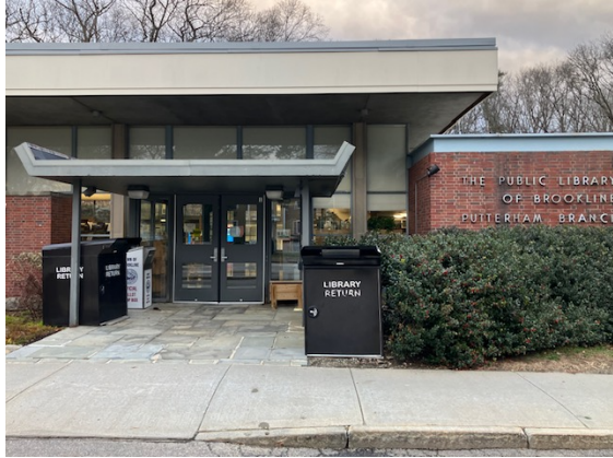
The library is a great place to visit!