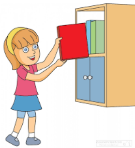
I can take books off the shelves to look at.