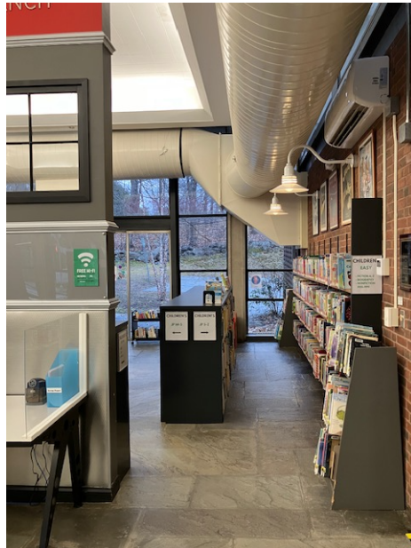
To get to the Children's room, just walk right past the front desk.