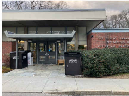
The Putterham Library in Brookline is at 959 West Roxbury Parkway.