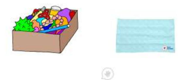
If I want one, I can use a fidget or a lap pad.