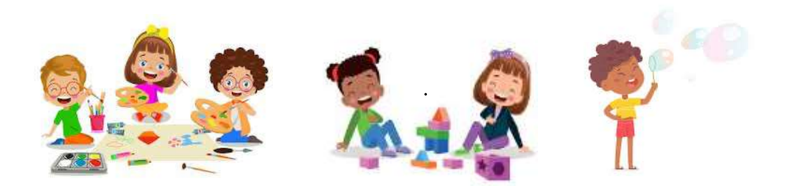
Storytime will last about 30 minutes; at the end, there will be an activity! We might color or do an art project, we might play with building toys or blow bubbles. I can stay at the activity for as long as I'd like.

If I want a break from storytime, I can tell my grownup and we can go into the Library. When I feel ready, we can come back. It is also OK to leave story time before the end if my grownup says it's OK.